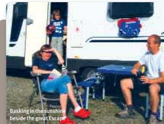
Basking in the sunshine beside the great Escape

Maybe it's me, but I found myself far happier with the pared-back nature of the Escape's facilities compared with more 'upmarket' motor caravans. For example, three gas rings are plenty. The oven size is convenient (although grill performance could be better – but that goes for most cookers). We coped easily enough with the fridge's 'mere' 80-litre capacity. The blown air heating is gas-only, but >>