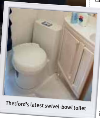
Theftord's latest swivel-bowl toilet

again proved no particular problem. The biggest kitchen niggle was the pathetic catch for the cutlery drawer – it kept working loose.