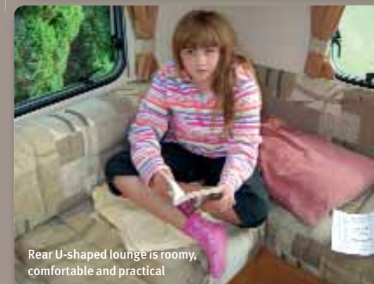
Rear U-shaped lounge is roomy, comfortable and practical

“The rear of the Swift lived up to its name as the place for lounging”