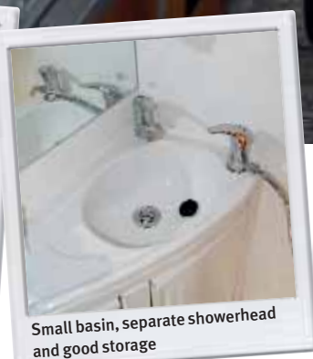
Small basin, separate showerhead and good storage