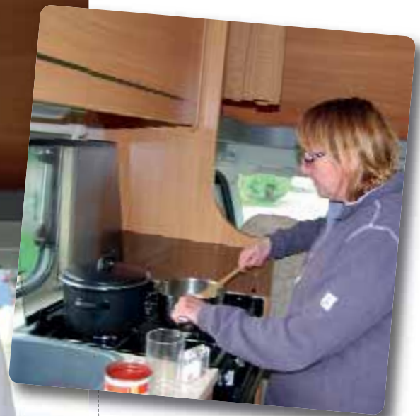
Kitchen gets away with average-size fridge and low-spec cooker, but work surface is good. Do you really need four gas rings, anyway?

corner steadies. Surprisingly, Swift doesn't currently list them as a factory-supplied option, but this is where your dealer may be able to help.