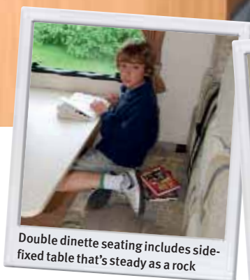
Double dinette seating includes side-fixed table that's steady as a rock

Swift Group will always have its critics (you're the UK market leader, guys, it comes with the territory), but with this Escape 686 it has just got it so right. Swift describes sales as 'excellent'. I'm not surprised – at the price, it's also an adequate description of this unit. ■