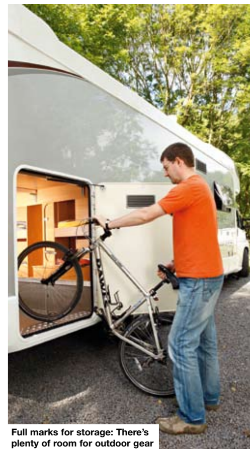
Full marks for storage: There's plenty of room for outdoor gear

In addition to the rear garage, the Swift also boasts plenty of interior storage, including two wardrobes plus many drawers and lockers.