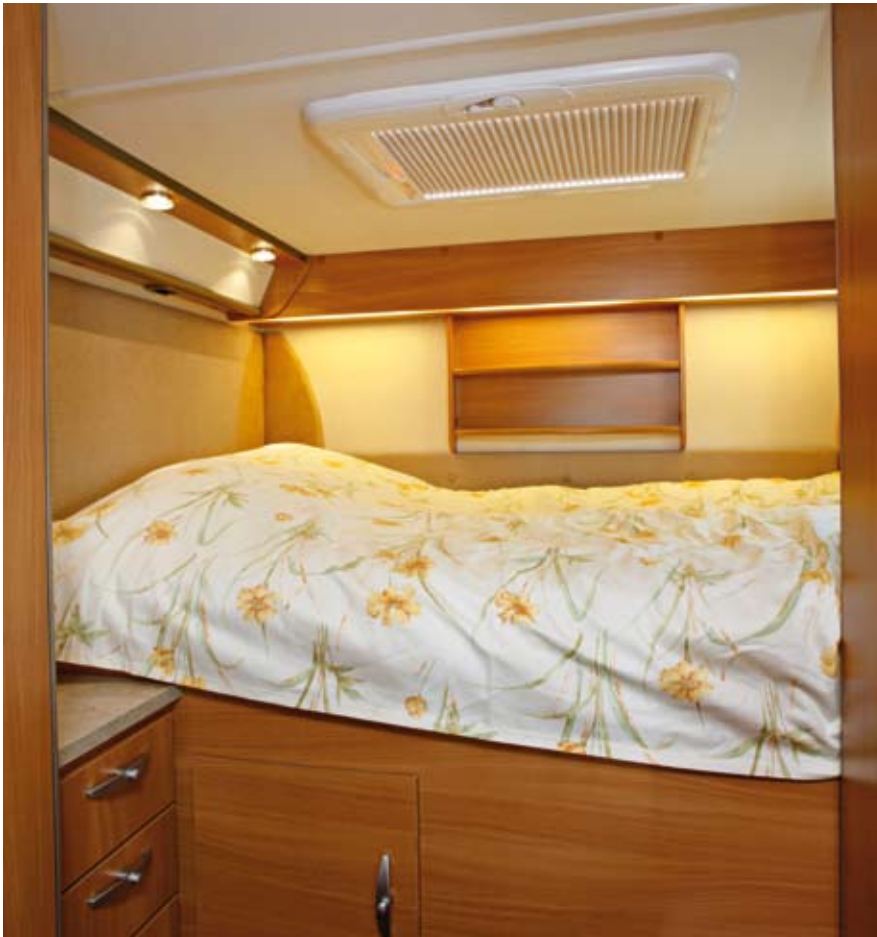
The large rear double bed with its domestic-style mattress, will ensure a good night's sleep