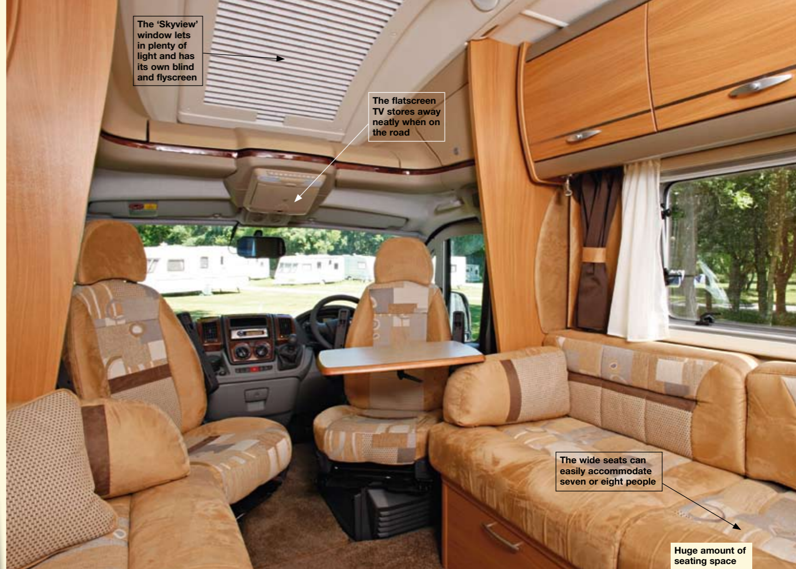
The 'Skyview' window lets in plenty of light and has its own blind and flyscreen