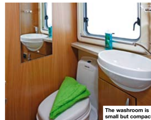
The washroom is small but compact