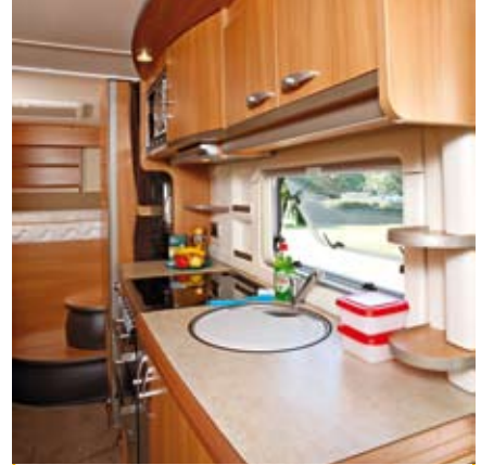
Plenty of work space in the luxury kitchen

For a personal quote contact 0844 847 4478 or www.shieldyourmotorhome.co.uk