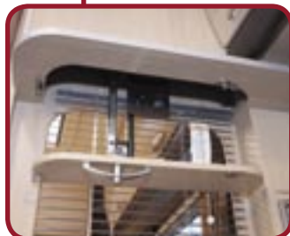
Your flatscreen television hides in this slim room-divider cabinet