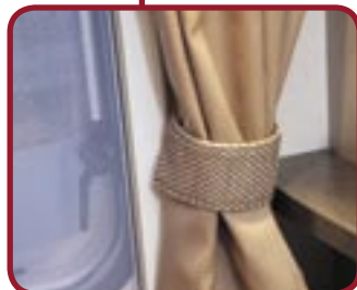
Tie-backs match the upholstery; the whole look is light and bright