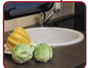
The large granite-look sink looks even more sparkling set into a dark surface