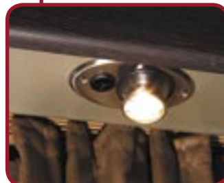
Spotlights hide under the dark chocolate brown cupboard edging