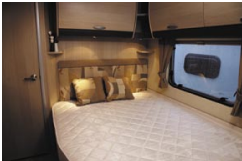
The bedroom has three good-sized lockers overhead