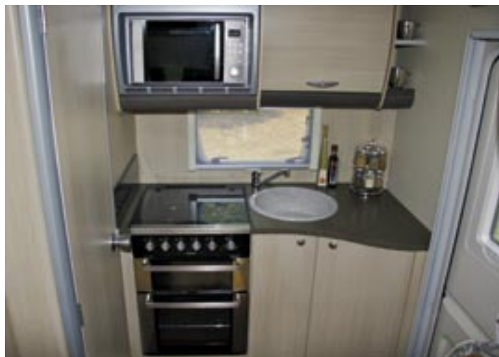
The curve on the right side of the kitchen creates clever use of cupboard space

Axes: 1 Berths: 2 MRO: 1026kg MTPLM: 1200kg Overall length: 5.52m Width: 2.23m Headroom: 1.95m