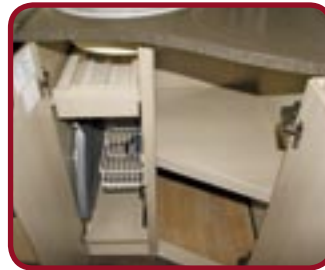
The kitchen cupboard configuration is excellently designed