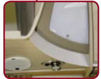
Large mains-powered corner lights with spotlights under the lockers