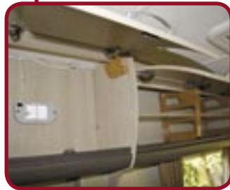
Good-sized head-height lockers but not all have shelves half-way