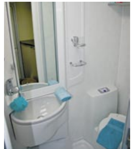
The shower area is surprisingly large

A glance outside at the Europa's length has you pondering just how Swift managed to cram in all this. It may be small but the 390 still has a lot of conventional layout features. In the centre you'll find a low unit that houses the fridge and offers additional kitchen worktop above. Moving forward from the working end, the lounge's full-length settees seem to look longer than they are, effectively giving the little tourer the illusion of greater space than it has. ■