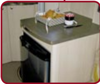
The top of the fridge gives you useful additional kitchen space