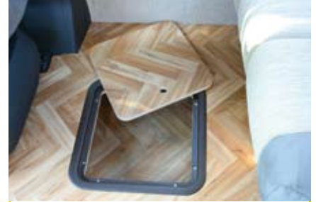
There are plenty of hidden storage areas

For a personal quote contact 0844 847 4478 or www.shieldyourmotorhome.co.uk