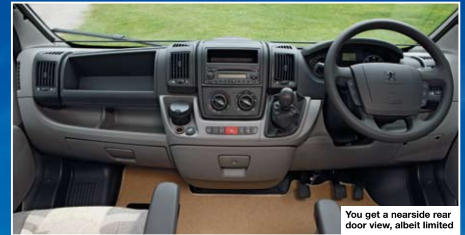
You get a nearside rear door view, albeit limited

Autocruise has already been offering this type of layout in the form of the Pace van conversion, but for the 2010 model year it has introduced a new version with the Accent. What's the difference? Instead of having a space at the rear, fairly useless when the bed is not in use, the Accent has a pair of inward-facing settees at the back, which make-up into a transverse double bed. This extra level of versatility means you can leave this area made up as a double bed, or use it as a second lounge area during the day, using these twin settees.