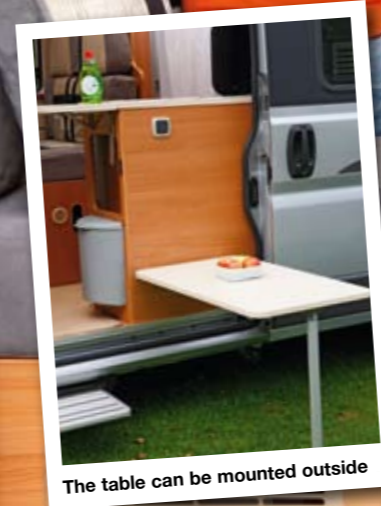
The table can be mounted outside