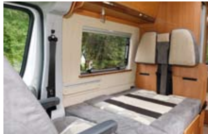
Plenty of room for smaller children to sleep

Adding to the quality feel is the neat bound-edge carpet, which is in three separate sections, allowing you to remove one or more if you are staying on a muddy site, to reveal the vinyl wood-effect floor below.