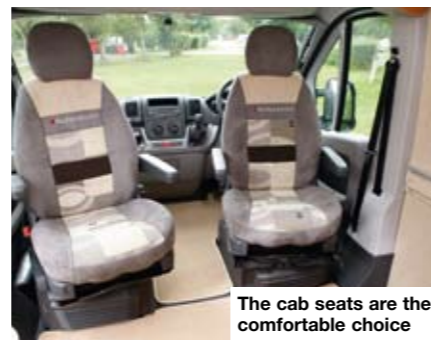
The cab seats are the comfortable choice

The kitchen is in the centre of the van, between the front and rear seating areas, so whichever you choose to use, you'll be able to serve up food fairly easily. Perhaps you could even have a 'his 'n' hers' evening with your friends – with the ladies playing cards at one end of the van, while the men drink beer and discuss motorhome reversing problems at the other end!