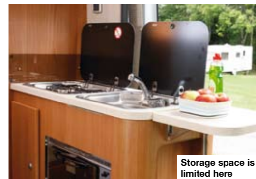
Storage space is limited here