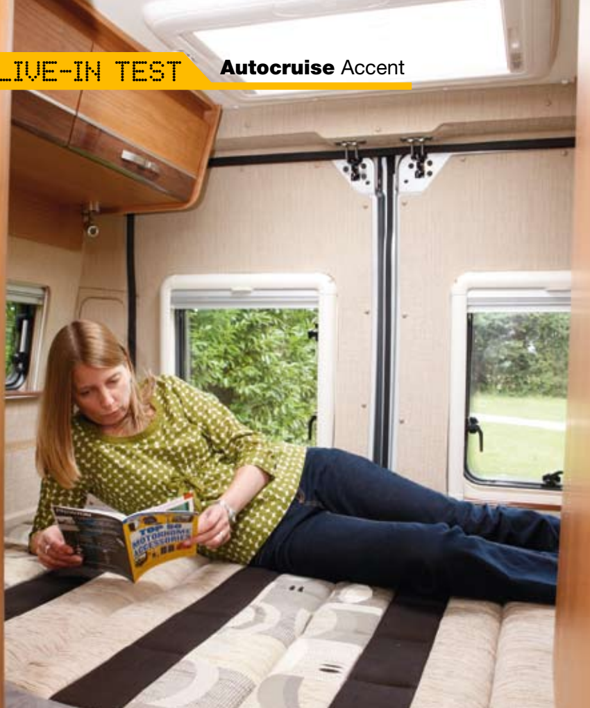
The rear bed will accommodate most couples