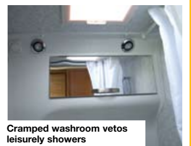
Cramped washroom vetos leisurely showers