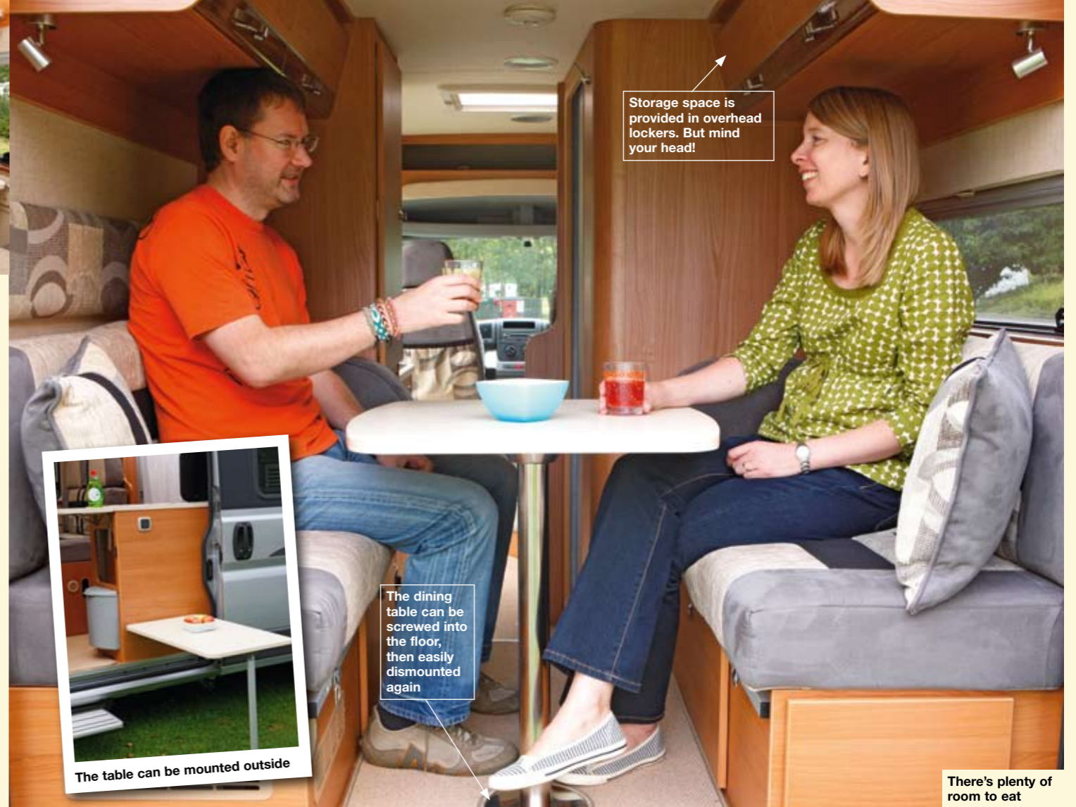
Storage space is provided in overhead lockers. But mind your head!