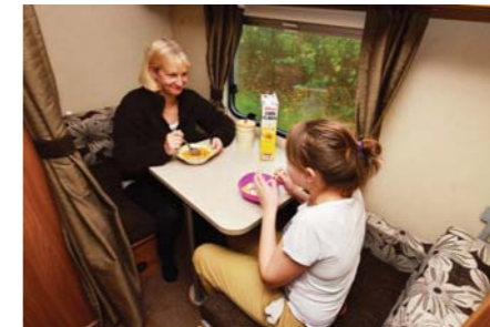
The end dinette is ideal for two. There's a blown-air outlet and a clear roof vent, but an electrical socket is lacking.

One rather annoying feature of the kitchen was the glass shield near the door, designed to protect the hob flame. It simply got in the way, and it would be better if it was detachable.