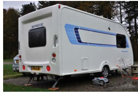
The Musketeer looks impressive for entry level, and overall finish was excellent. Reversing lights are standard.

Good additions are offered with the Diamond pack in the form of alloys, AKS hitch, Al-Ko wheel lock receiver, spare wheel, radio/CD player and scatter cushions. It represents good value - something we're very keen on.