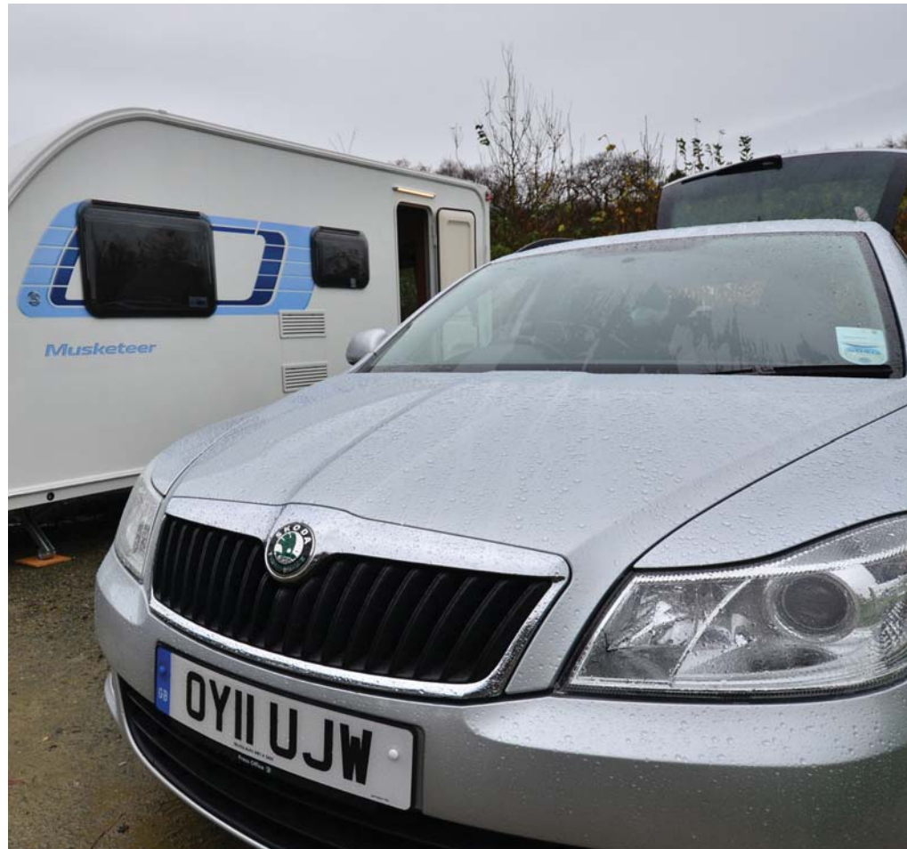
The Musketeer EB and Skoda Octavia made a stable outfit. We love the Musketeer's profile - and the Octavia's isn't bad, either!

Our thanks to Stewart Longton Caravans of Blackpool, and to the wardens of The Camping and Caravanning Club's site at Delamere Forest.