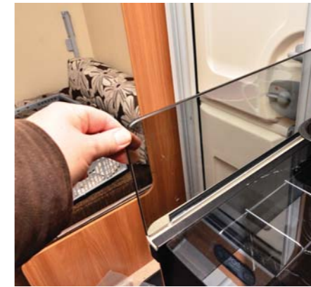
The glass hob shield kept getting knocked; it should be easy to remove when not needed.

illumination comes from a dome ceiling light and a strip light beneath the roof locker.