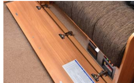
Front seat bases have excellent access via the large flaps; the electrics are here, too.

The Sprite is relatively easy to move around, and we liked the solid, chunky grab handles. An LED awning light is fitted, along with a side wall radio aerial and a roof-mounted Status 530 TV aerial. Water and waste connections are on the offside.