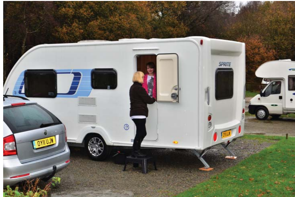
Respite from the rain. We all agreed that a glazed stable door would be better.

We don't like: Pull-out coffee table isn't stable, no rear power point, glass side shield by hob, no glazed door.