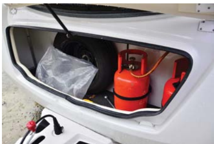
Brilliant front locker size - easy to access, too.

In terms of towing stability the Musketeer proved a joy to tow, and the Octavia made it easy as we battled through heavy sleet and side winds. After a very enjoyable weekend, we were inclined to think... is this the best Sprite yet?