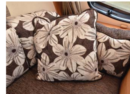
Soft furnishings are good quality, and we have grown to like the dark brown!

At the rear of the Musketeer is a single dinette, which makes up into bunks at night. As a dinette, it's big enough for two adults to use (the Musketeer would make a great couple's van!) while Jackie and I both tried it as a single bed and found it fine for length and width. The small table is substantial, with a leg that clips into the floor.