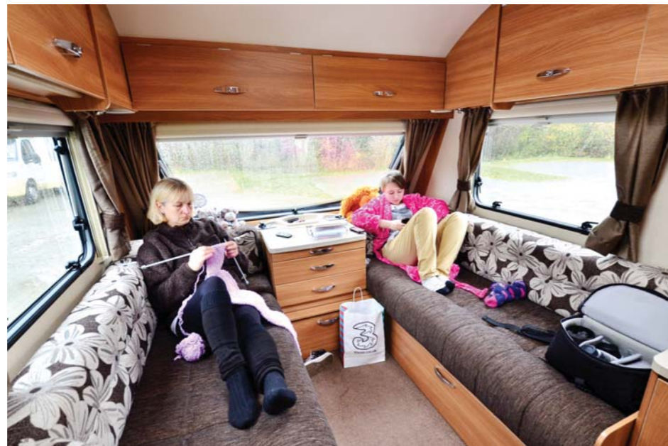
Large front lounge makes it easy to stretch out and relax.