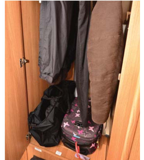
The wardrobe was ample for our weekend away.

The central wardrobe was impressive: on a weekend trip we had plenty of space left over, so longer hauls shouldn't be too much of a problem. In the washroom, good storage was provided by plastic shelves and a cupboard. Likewise, the kitchen offered excellent storage.