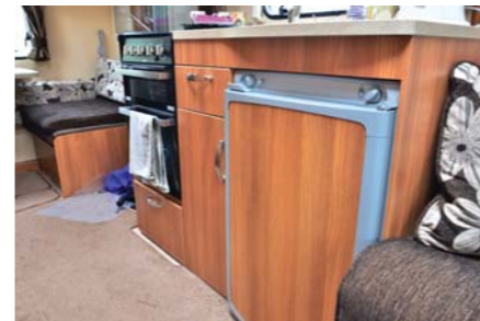
The side kitchen has a fridge, oven with spark ignition and more storage.

Above the entrance door, the touch control panel for the lights and pump is relatively easy to use. On a wet weekend in December, the Truma heating kept us warm as the rain hammered down.