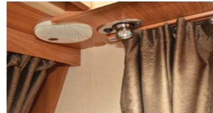
Speaker and one of the four spots over the front lounge; two more are in the rear dinette..

Night lighting is provided by four spotlights and a dome ceiling light. They are brilliant, giving the lounge area plenty of light. A radio/CD player is placed in a side front locker, with speakers above the front window. Sound quality is super - for some reason, we thought it was better than that in the Challenger Sport.