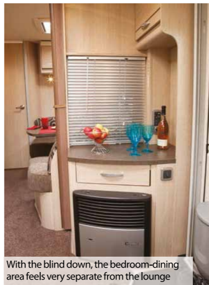
With the blind down, the bedroom-dining area feels very separate from the lounge