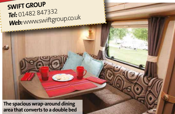
The spacious wrap-around dining area that converts to a double bed

SWIFT GROUP Tel: 01482 847332 Web: www.swiftgroup.co.uk