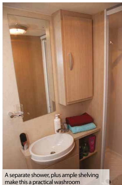
A separate shower, plus ample shelving make this a practical washroom