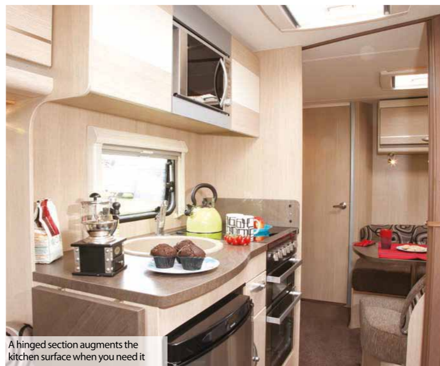
A hinged section augments the kitchen surface when you need it

Storage under this U-shaped seating area is not as easy to access as that under the front settees. But there is a bonus in the dining room – an exterior access hatch. It's the same size as a toilet cassette hatch, so not large enough to put in big items, but perfect for small things.