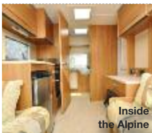
Inside the Alpine