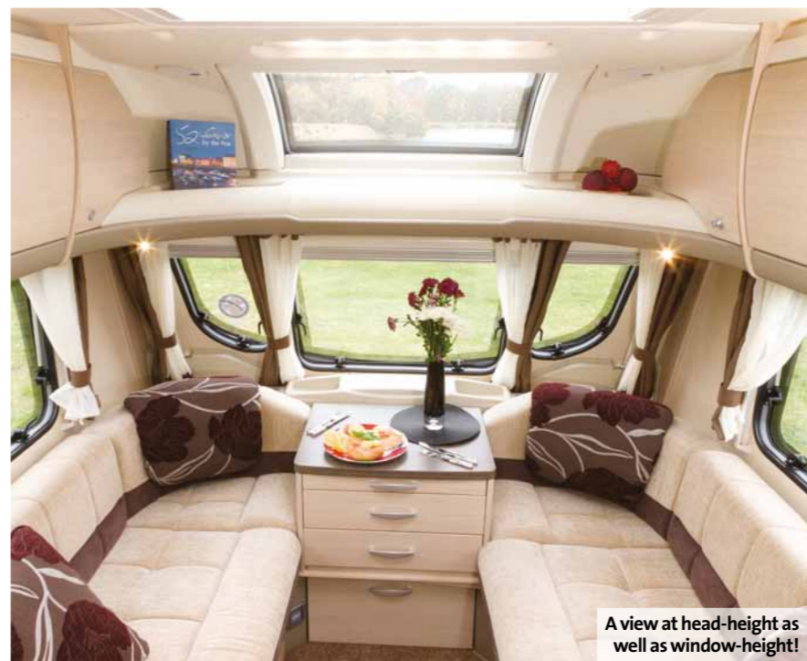
A view at head-height as well as window-height!

The bed doesn't rise as far as most, making reaching for stuff underneath difficult. And the table is stored on top of the bed frame, so you have to remove the table to get at what's underneath it. Lifting a table in and out of this horizontal position takes a fair amount of strength – far more than sliding a table into a vertical slot.