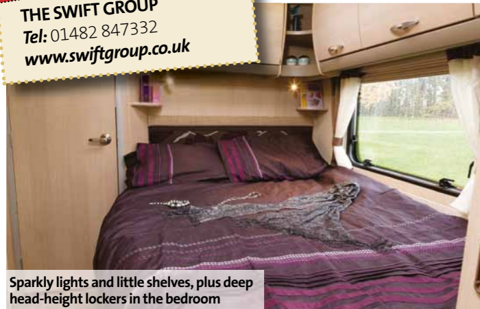
Sparkly lights and little shelves, plus deep head-height lockers in the bedroom

GET IN TOUCH THE SWIFT GROUP Tel: 01482 847332 www.swiftgroup.co.uk