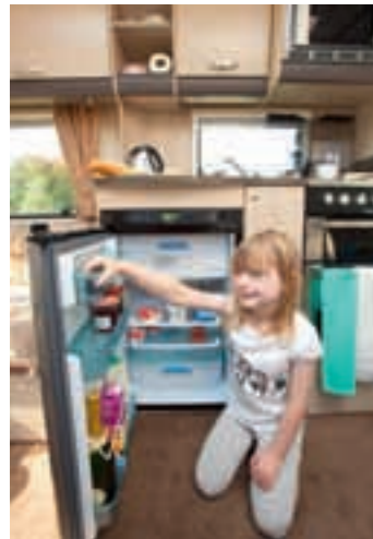
Fridge has a large freezer but the door hits the seat base when open

The large fridge with a full-width freezer shelf was well liked. "Having a big freezer means you