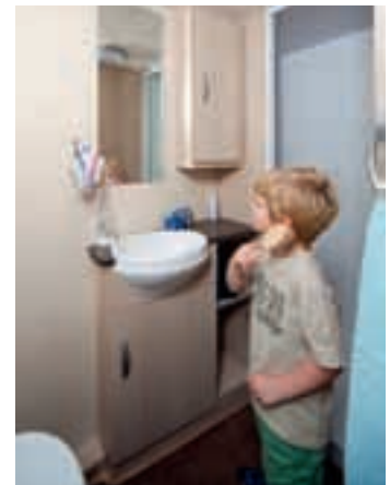
There's good storage and a towel hoop in the spacious washroom