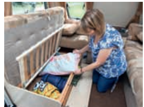
The bed boxes are easily accessed. The storage options in general are very good in the 545

works well. You lift the bed base and the table rises with it. The table is so light you can lift it with one hand. It's not something we'd be doing over and over again but I'm surprised how easy it is to remove."