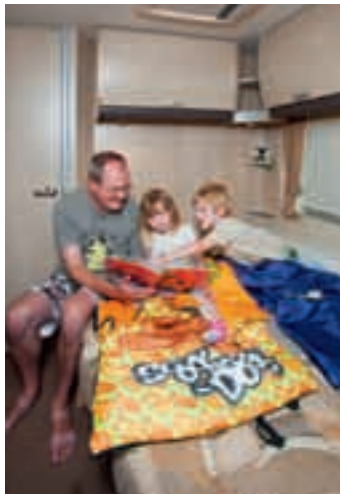
The U-shaped lounge takes a bit of working out to assemble into a bed

shorter people. I'm surprised that there is only one roof locker in the kitchen. The small locker on the other side of the van is ideal for cereal boxes though, so I'd definitely use that one for big stuff and probably spill over into the one next to the kitchen that has the radio in it."