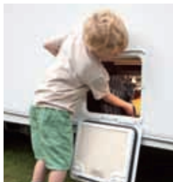
The twin-dinette layout gives a family lots of living space by day. LEFT External access to underbed storage is small