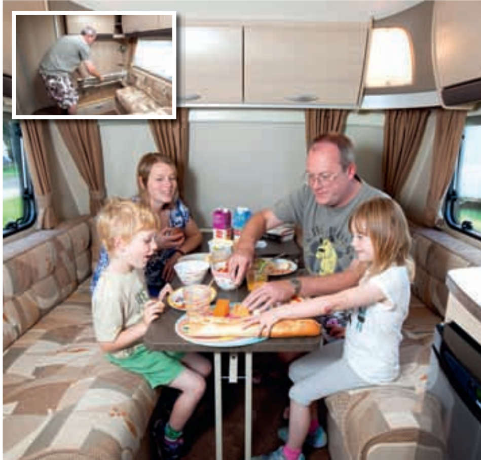
There's plenty of elbow room for four people to dine in the front lounge. The lightweight dining table is stored beneath the bed base in the rear dinette (inset) and is easy to get to