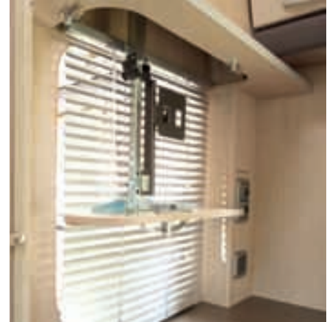
The mount for a small flat-screen TV slides up into any eye-level locker when not in use