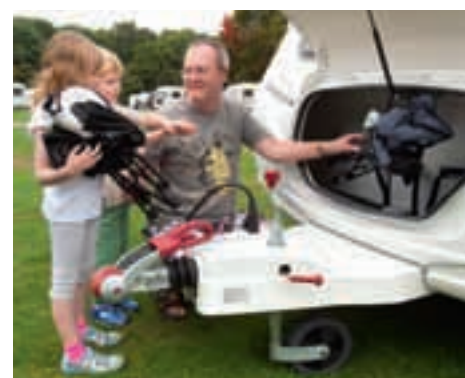
Access to the front locker is easy because the lid lifts nice and high