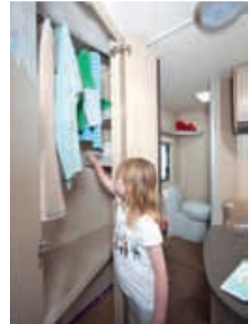
The wardrobe is wide but tapers at one end. It could do with a shelf