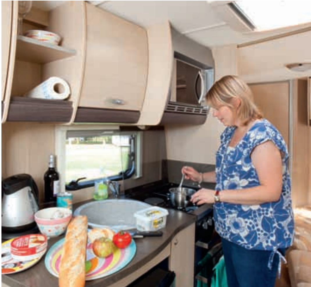
The kitchen is small but it has everything. Worktop space is limited but the designers have tried to create a little more by setting the sink far back. There is only one overhead locker but there is cupboard space opposite