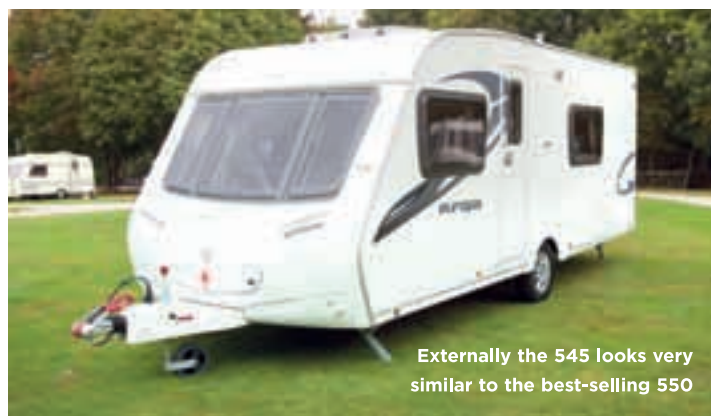
Externally the 545 looks very similar to the best-selling 550