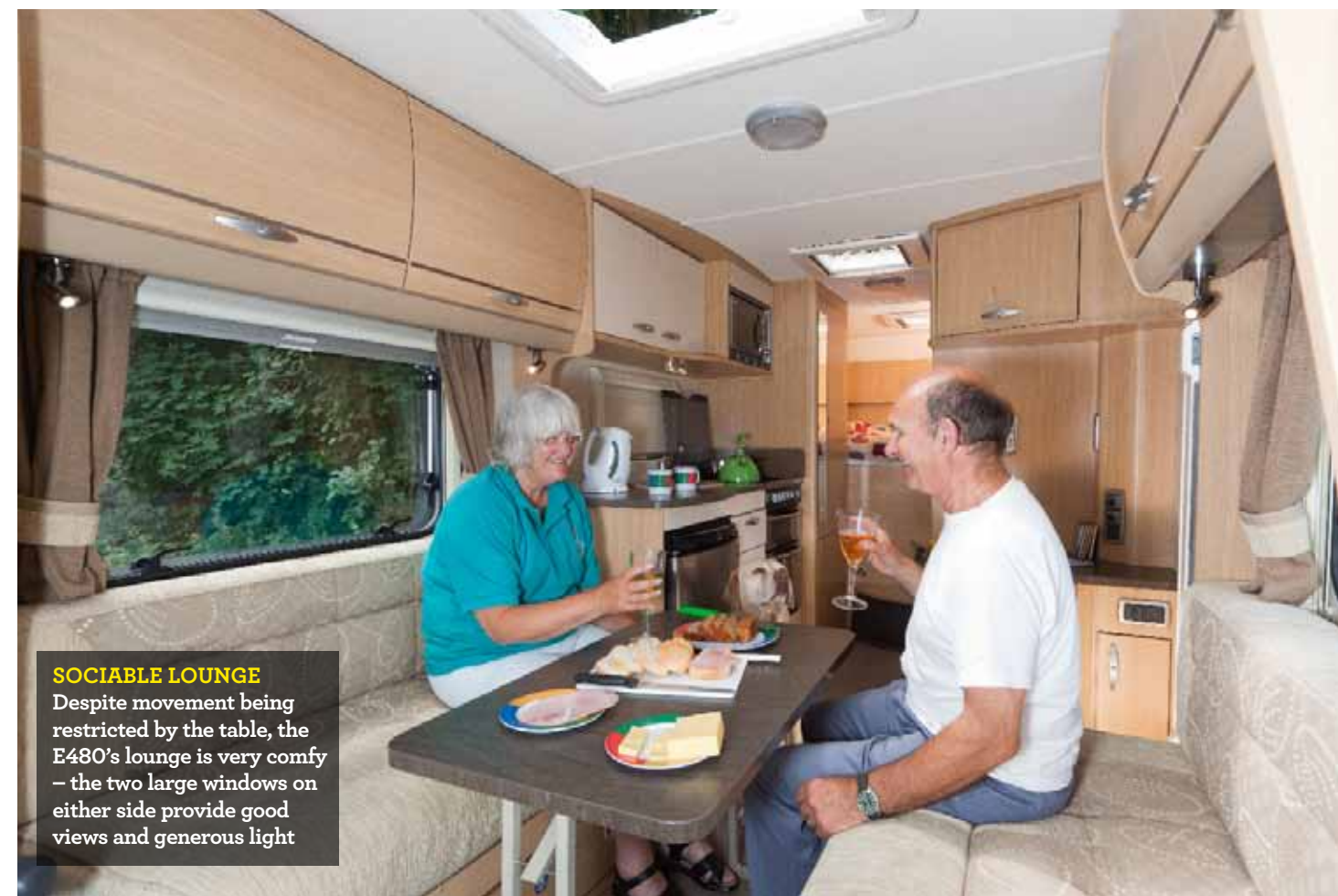
SOCIABLE LOUNGE Despite movement being restricted by the table, the E480's lounge is very comfy – the two large windows on either side provide good views and generous light