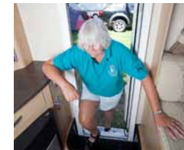
BIG STEP UP The standard-height chassis results in two high steps up to the habitation, which might cause problems for some