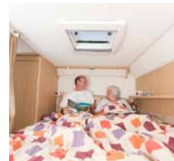
RESTING PLACE The area around the large rear transverse bed has been thoughtfully designed, and includes ample shelving and lighting