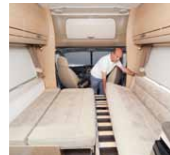
GUEST ROOM The facing-sofa lounge lends itself well to the creation of a spacious double bed, for guests – it's easy to set up and very comfortable