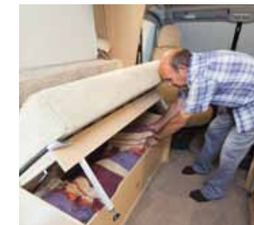
NEAT SEAT Both of the sofas in the lounge offer storage space under their lift-up bases, and the space under the nearside sofa is particularly generous