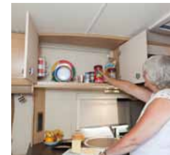
ALL AND SUNDRY The cupboard above the kitchen unit is a very versatile space, but the doors are a bit of a head-bump hazard when open